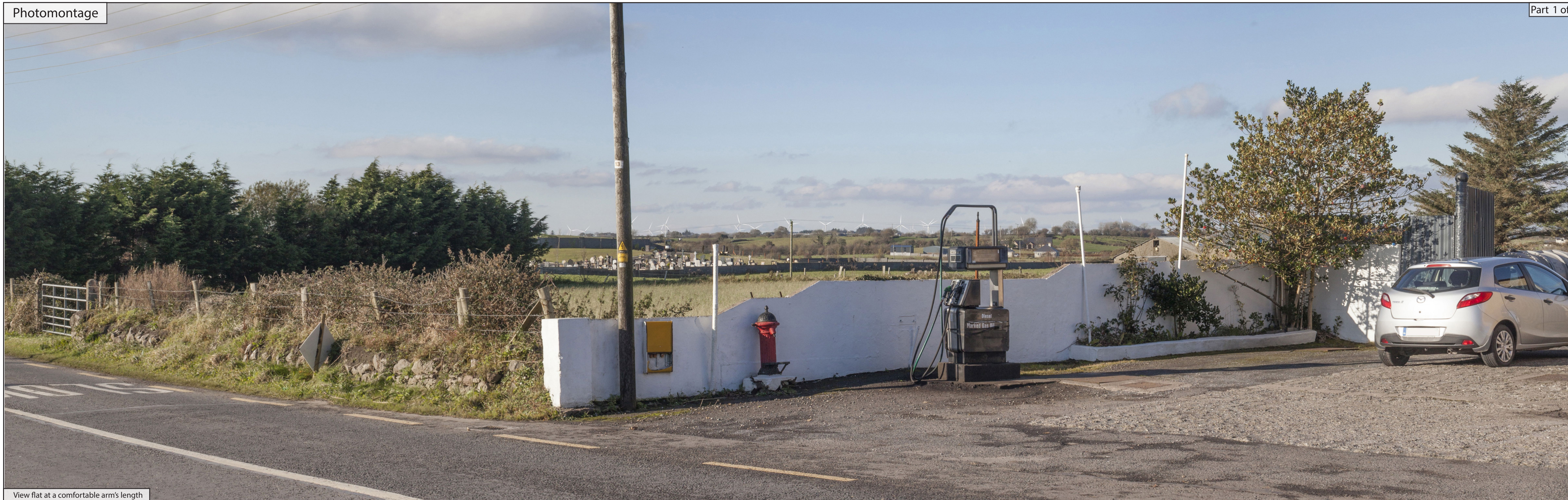
View flat at a comfortable arm's length

This planar projection panorama has been captured, prepared and presented in accordance with the guidance set out in the Scottish Natural Heritage 2017 guidance 'Visual Representation of Wind Farms'.